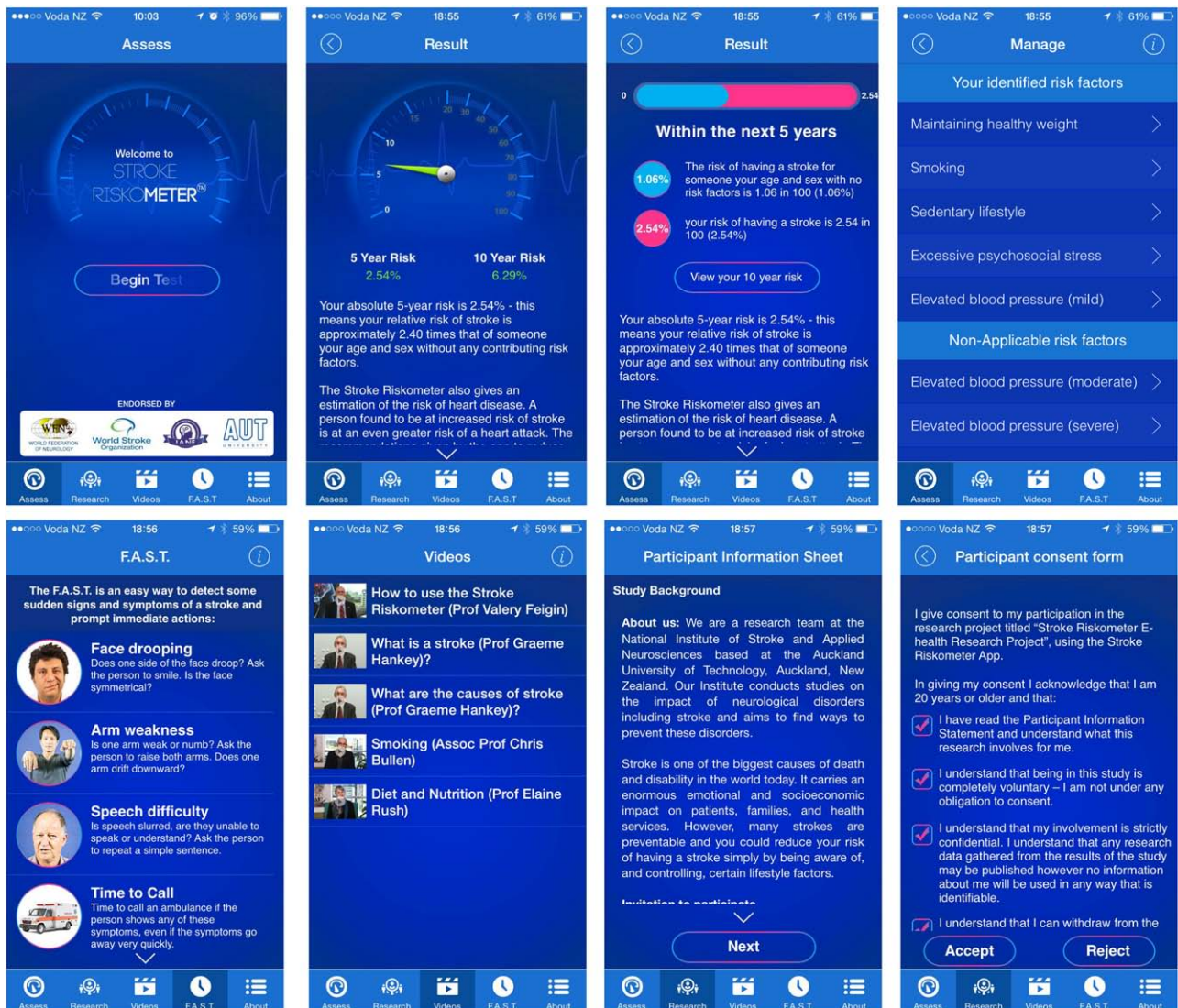
Figure 1. Example of screenshots of Stroke Riskometer App. F.A.S.T. indicates face, arm, speech, time.

The app has a section to educate people about stroke warning symptoms and signs and what to do if any of these symptoms/signs occur. This section uses the face, arm, speech, time message, a strategy shown to be effective in reducing the time to hospitalization. 41 In addition, users have an option to e-mail their stroke risk assessment results to a person of their choice and they also have an option of sharing their experience of